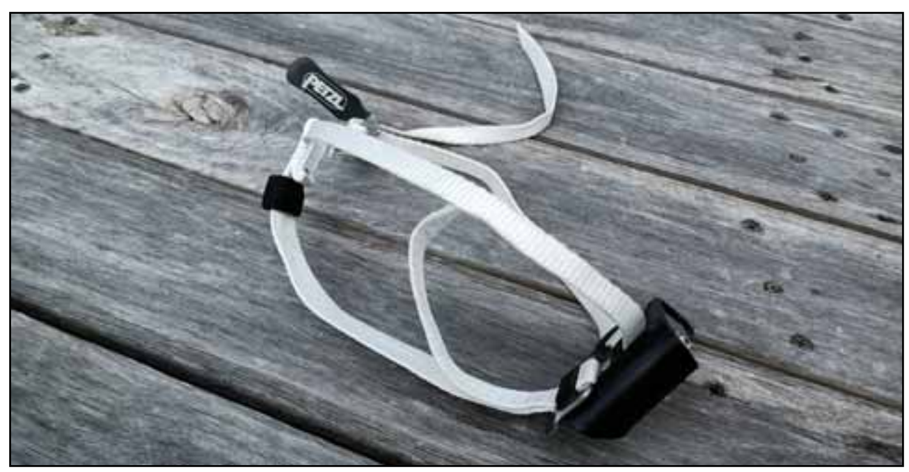
Photo 1: The Petzl Pantin Foot Ascender. Journal of The Sydney Speleological Society, 2023, 67 (12):#

For me when I tried this, my left foot would always want to fall out of the foot loop during the reset of the hand ascender phase.