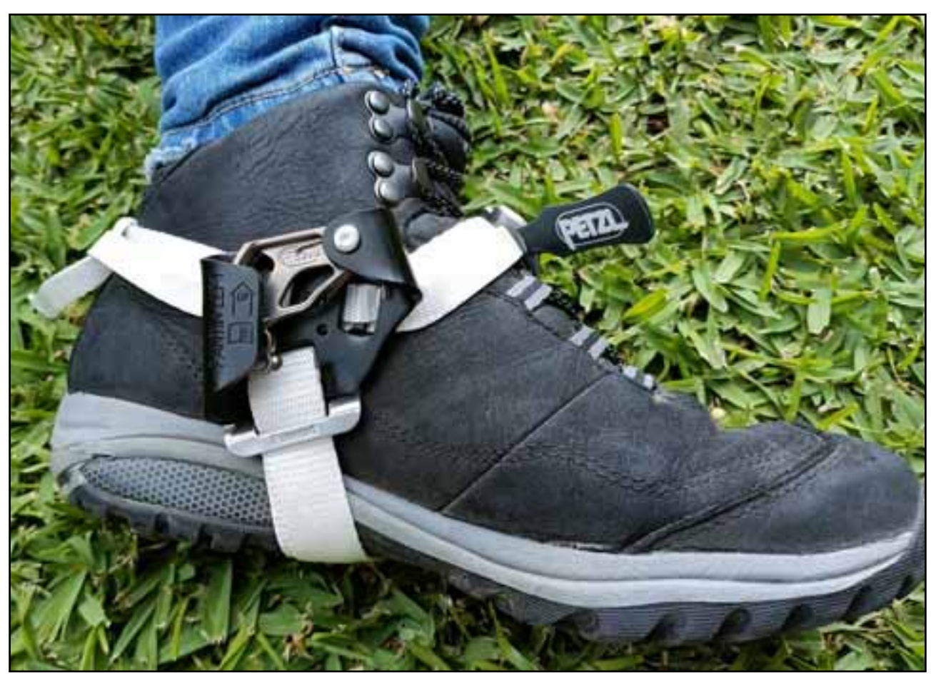
Photo 3: The Petzl Pantin Foot Ascender attached to a boot. As always, come to a training day and try before you buy. It is a great piece of kit that can really make ascending much easier and enjoyable. JSSS